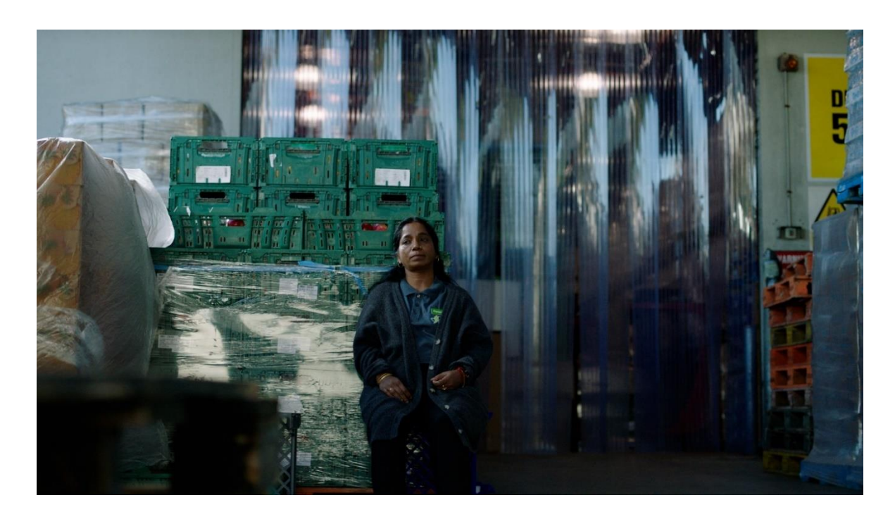
Film Still: Perianayaki (2022) – Directed by Bala Murali Shingade, written and produced by Shreya Gejji Official Selection: Whānau Mārama: New Zealand International Film Festival NZ's Best Competition - Winner Flicks Award for Best Short Film, NZ's Best Audience Award, Creative New Zealand Emerging Talent Award (Bala Murali Shingade), NZ's Best Special Mention for Performance (Jeyagowri Sivakumaran), Melbourne International Film Festival, Show Me Shorts Film Festival, Dharamshala International Film Festival, Tasveer South Asian Film Festival Seattle, Chicago South Asian Film Festival