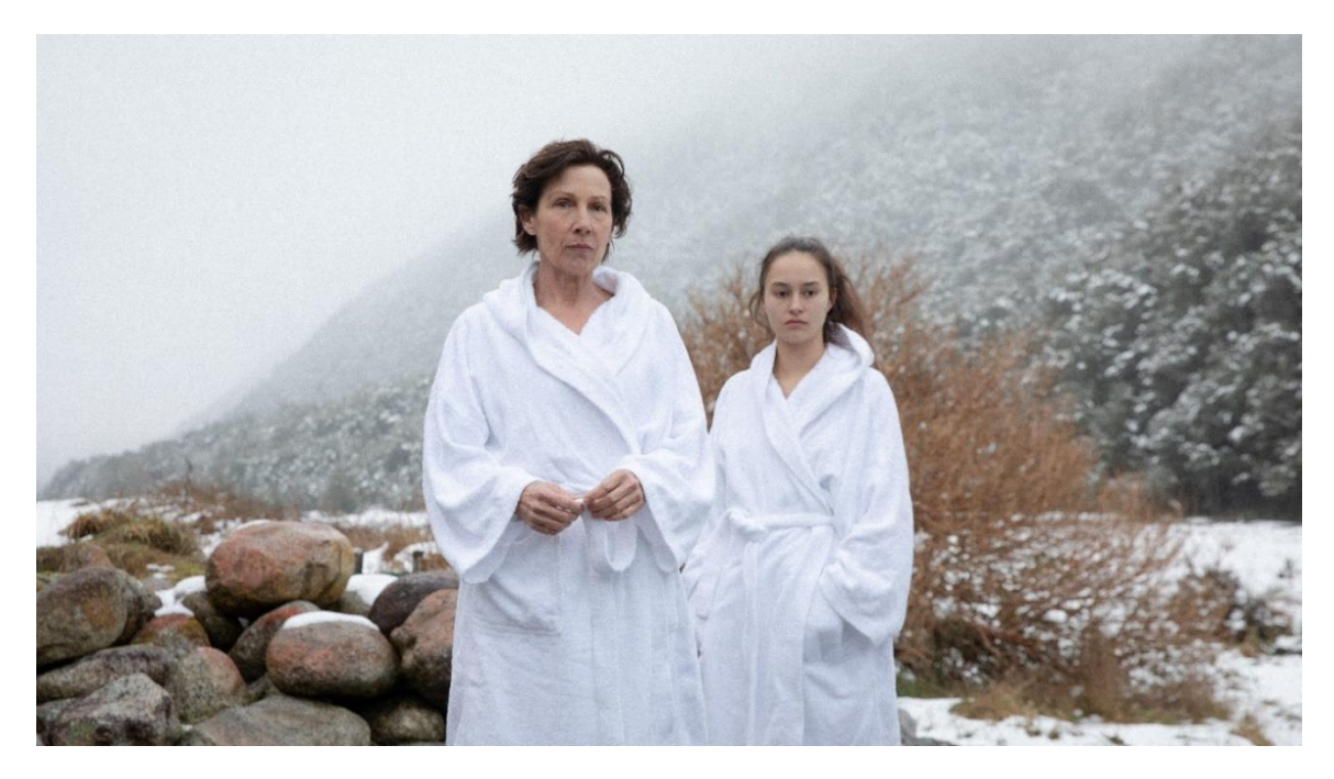
Film Still: Hot Mother (2020) – Written and directed by Lucy Knox, produced by Evie Mackay, co-produced by Bill Bleakley

Official Selection: Berlin International Film Festival, Melbourne International Film Festival, Whānau Mārama: New Zealand International Film Festival, Flickerfest International Short Film Festival