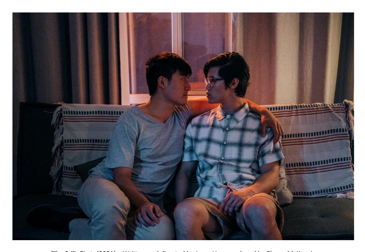
Film Still: Firsts (2021) – Written and directed by Jesse Ung, produced by Elanor McKenzie Official Selection: BFI Flare LGBTQIA+ Film Festival, Outfest Fusion QTBIPOC Film Festival, Queer Screen Mardi Gras Film Festival Sydney, Los Angeles Asian Pacific Film Festival, Melbourne Queer Film Festival, Out On Film Atlanta's LGBTQ Film Festival, Gaze International LGBTQ+ Film Festival, Seattle Queer Film Festival, Indianapolis LGBT Film Festival