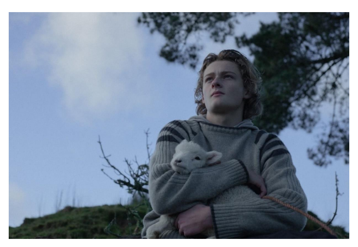
Film Still: Rustling (2022) – Written and directed by Tom Furniss, produced by Morgan Waru (Ngāti Porou)

Festivals have strict regulations around what they consider a 'short film' with regards to film duration, and this can vary between events. Some festivals consider a short film as being anything under 40 minutes, while others, like Cannes Film Festival, will only consider short films with a maximum run time of 15 minutes including credits. You might see some festivals placing non-feature length films under categories of short or medium length, with your film sitting in the medium length category as it is 21 minutes. It is important that you carefully check the requirements for your chosen festival and submit to the appropriate category.